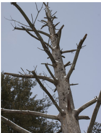
An Old Tree that provides habitat