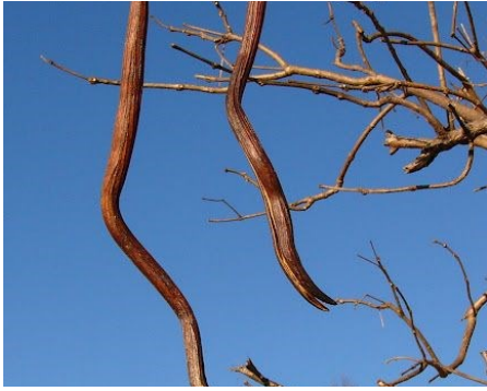
Catalpa Seed Pods