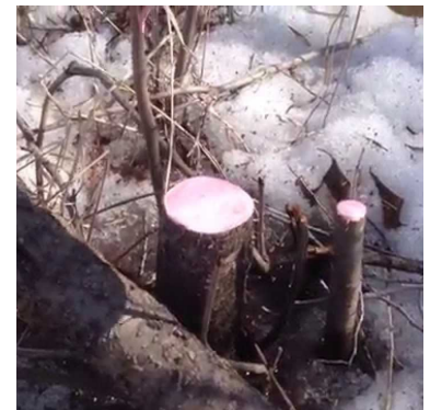
Sign of Restoration